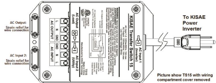
Picture show TS15 with wiring compartment cover removed

AC Loads: 15A max for TS15 and 20A max for TS20