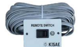
Remote Switch (optional)