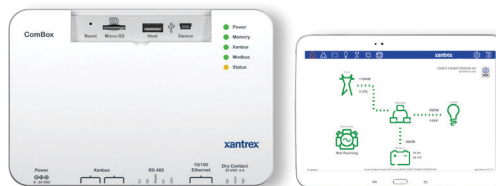
FREEDOM SW Conext Combox (809-0918)

Available telephone to network cable adapter to avoid the need to replace cables when replacing and old inverter. (#808-9010 sold separately)