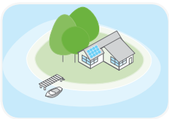
Residential off-grid solar